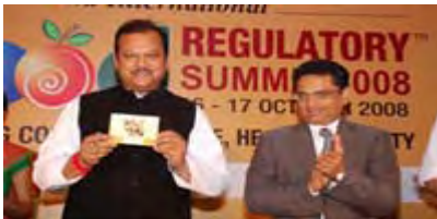
Hon'ble Minister releasing the CII-Food Safety Tips for Housewife booklet