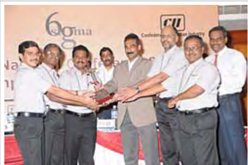
1st Prize Winner

Amara Raja Batteries Ltd, Tirupathi – 1st Hindustan Zinc Ltd, Visakhapatnam – 2nd Sutherland Global Services, Chennai – 3rd