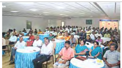
Delegates at the Conclave